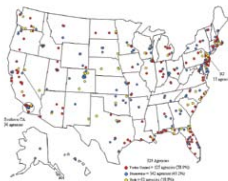
Figure 7. Approximate geographic location of the 329 government agencies that participated in the VBDS survey investigating mosquito production in structural stormwater BMPs

mosquito control agencies are meeting their goals. It may seem like a Catch-22, where anything you do can result in people getting sick, but it has been shown that addressing the concerns of both stormwater and mosquito control communities can help both sides meet their needs and sometimes even improve programs and attitudes (Metzger et al. 2008).