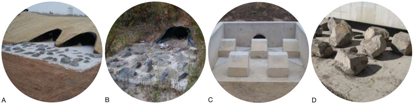
Figure 10. Alternative inlet designs installed by Caltrans in attempts to mitigate persistent mosquito habitat associated with loose rock riprap. Although not entirely fail-proof, each of the alternate designs (A, B: rock embedded in a concrete apron, C: cast concrete blocks, and D: boulders placed on top of a concrete apron) was far superior to the loose riprap and rarely resulted in mosquito production.

production in Caltrans's structural stormwater BMPs. The decade-long working relationship has raised awareness, improved maintenance schedules, and led to the retrofit of many structures with features less likely to hold standing water (Figures 8, 9, and 10). These efforts have potentially reduced the risk of mosquitoes and disease to residents and visitors of surrounding areas while improving water quality through improved maintenance of BMPs.