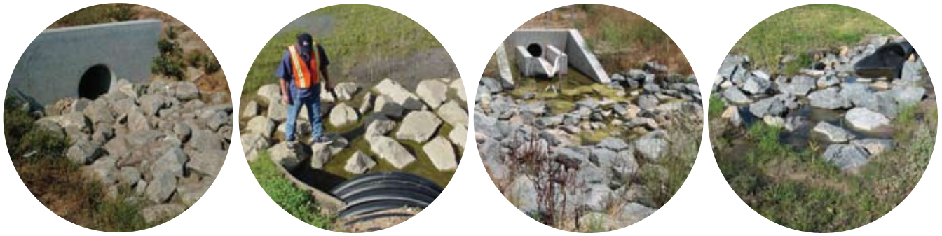
Figure 9. Four examples of loose rock riprap installed to dissipate water energy at the inlets of detention basins. This common feature consistently provided suitable mosquito habitat because of its propensity to hold standing water for longer than four days.