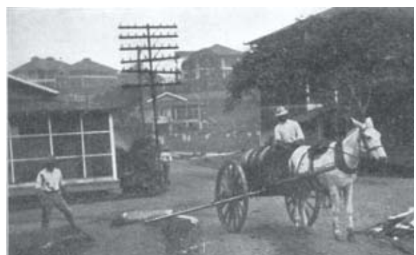
Figure 5. Laborers controlling mosquito larvae by applying crude oil to roadside drainage ditches in the Panama Canal Zone using a pipe apparatus, circa 1912

When you consider the close association between stormwater and mosquitoes, it comes as no shock that mosquitoes were reported in BMPs nationwide by participating agencies. However, responses revealed a number of unexpected program weaknesses and apathetic attitudes that could create barriers to interagency collaboration and compromise mosquito control efforts. Approximately half the agencies perform-