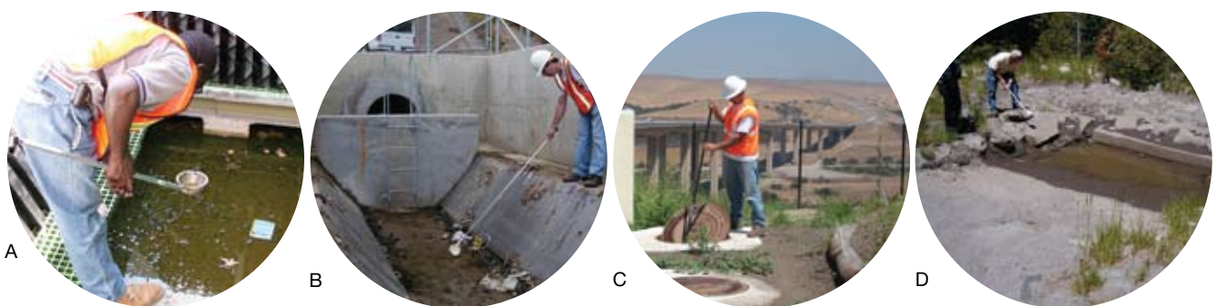
Figure 8. For over a decade, VBDS staff has monitored mosquito populations in over 100 Caltrans BMPs in various parts of California to identify problem areas likely to produce mosquitoes and to develop non-chemical preventive solutions. Some examples illustrating the diversity of structures examined include (A) a multi-chambered treatment train in Los Angeles County, (B) a gross solids removal device in Orange County, (C) a stormwater treatment system in San Diego County, and (D) a traction sand trap in the Lake Tahoe Basin.

water Program and California Department of Public Health Vector-Borne Disease Section (VBDS) provides an example of how collaboration can be worth the effort. Since 1999, VBDS has worked closely with Caltrans to develop long-term, non-chemical solutions to reduce mosquito