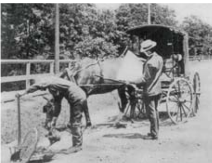
Chase and Nyhen 1903